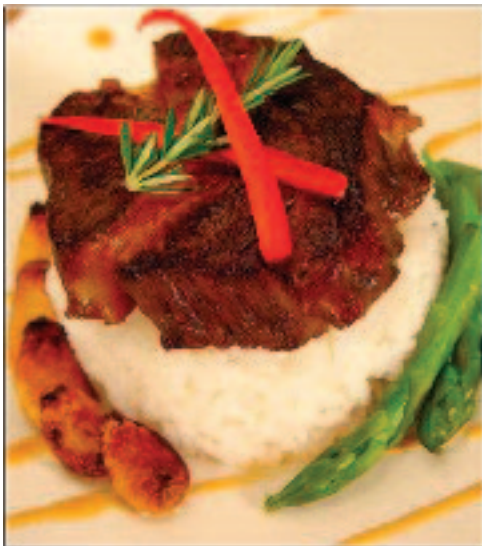
Miso Glazed Beef