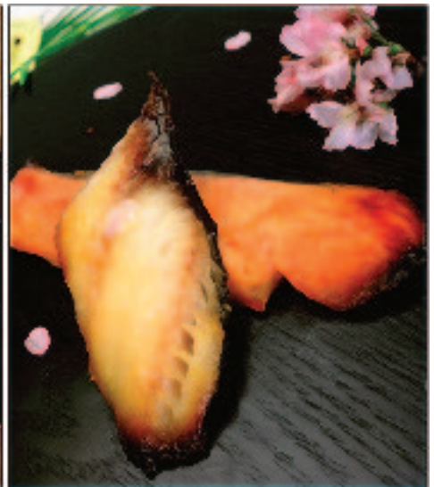
Miso Glazed Salmon & Black Cod